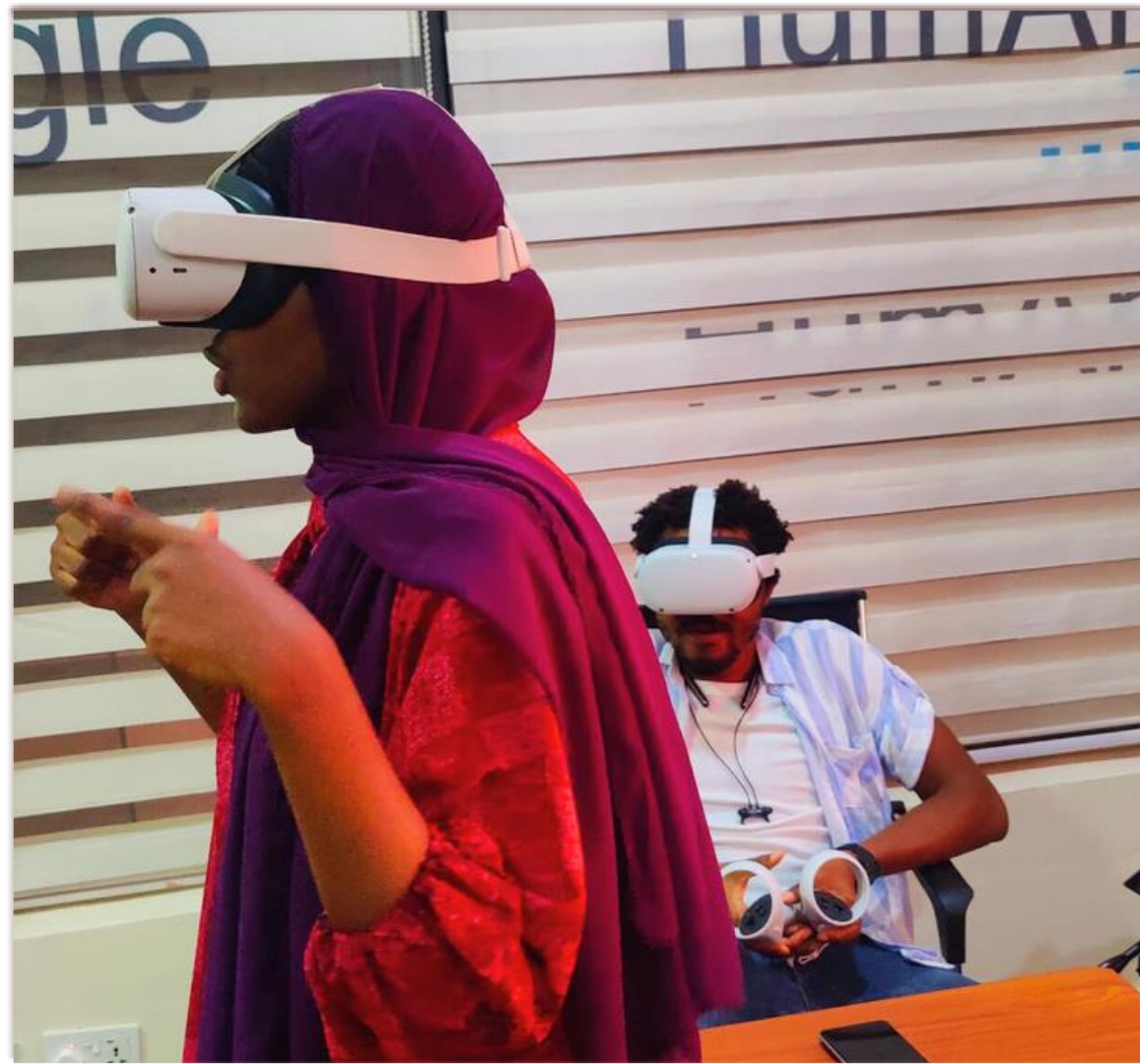
VR test-run at the office