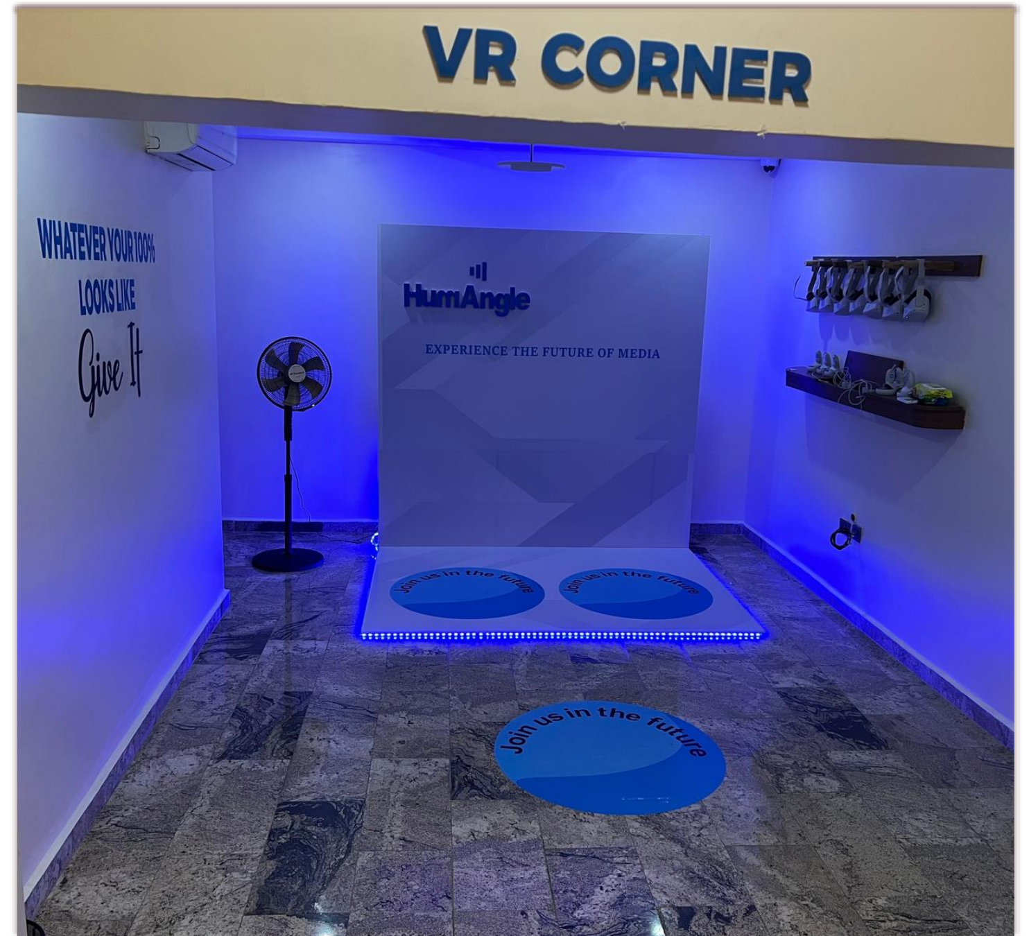
The HumAngle VR Corner